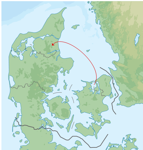
Figure 3: The Danish invasion theory (base map CCo Urutseg)