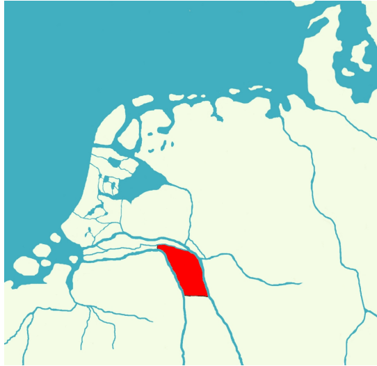
Figure 2: The Hettergouw area